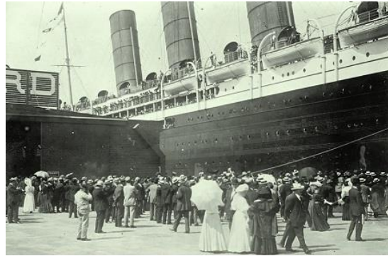
People excitedly boarding the Titanic

As Historians , we will be finding out what happened on the first sailing of the Titanic in 1912.